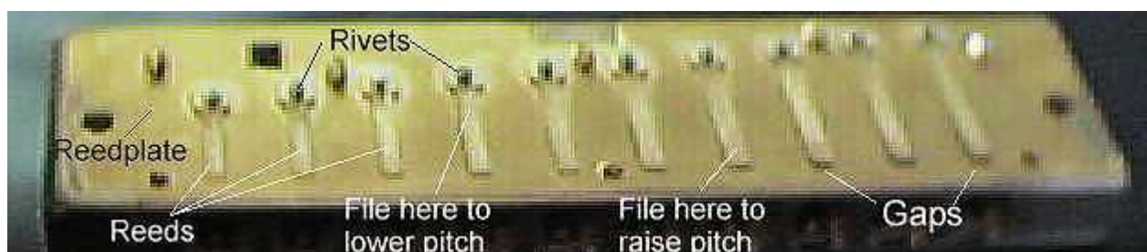
Diatonic Harmonica Reeds

Maintenance of a harp most often centers around the reeds, as shown in this picture. The rivets attach the reeds to the reed plates, and the reeds vibrate through slots in the reed plates to generate the sound. The action of the reeds depends on the gap between the reed and its slot in the reed plate.